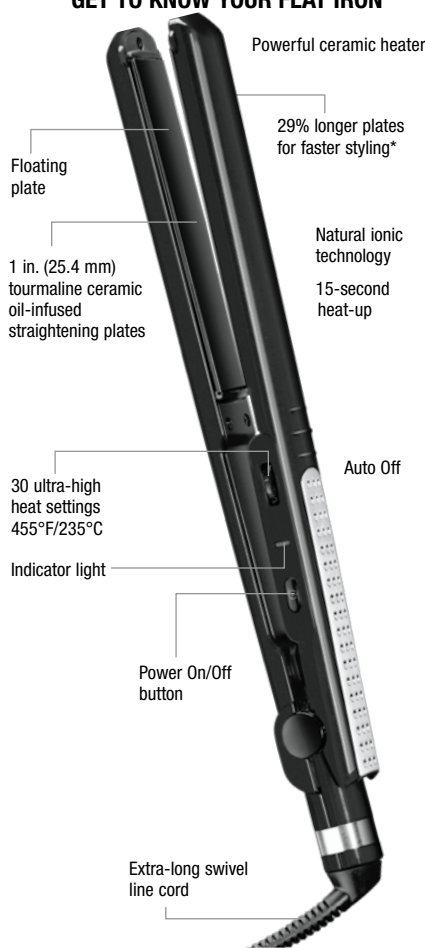
*When compared to other Conair® straighteners Actual plate size may vary